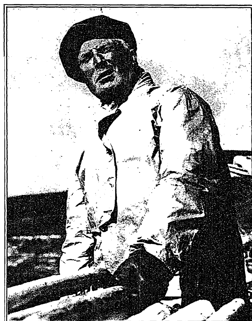
THE SKIPPER AT THE WHEEL: CAPTAIN BARTLETT, Who Was With Peary on His Polar Exploration and Who Has Made Many Voyages to the Far North, Takes a Squint Aloft as the Morrissey Goes Along Under a Good Breeze.