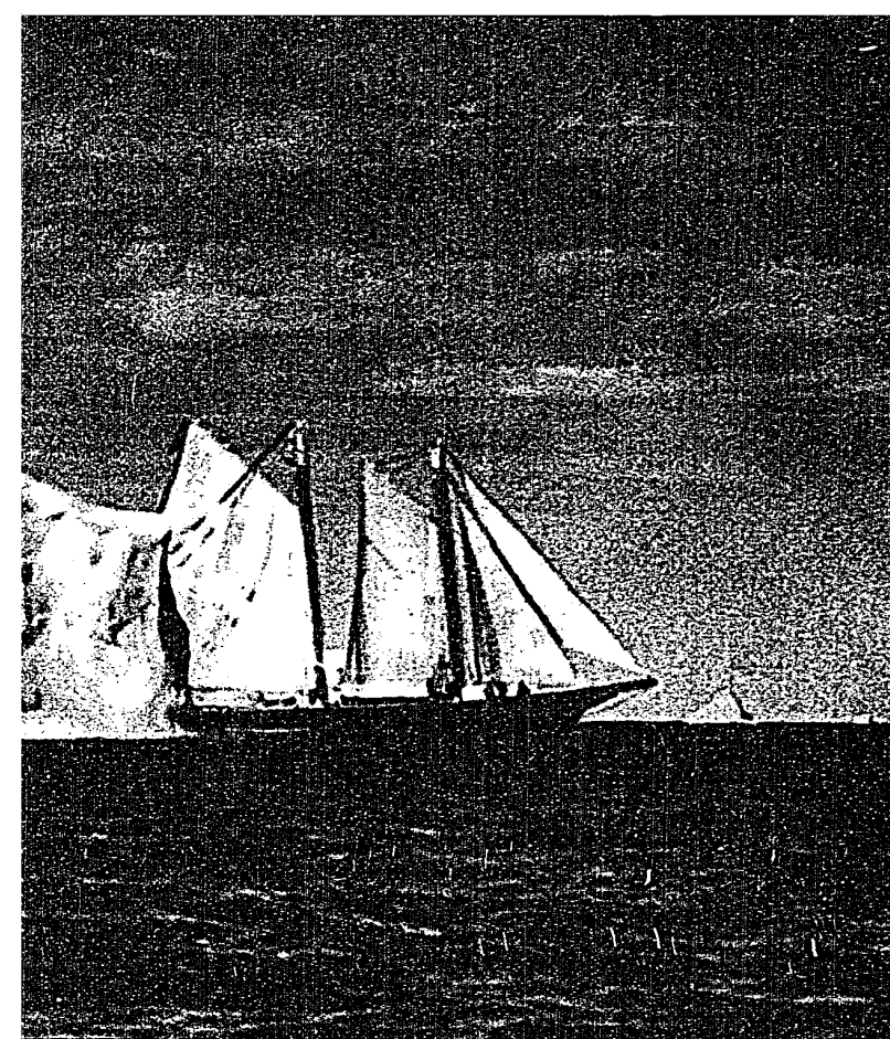
THE BIRTHPLACE OF THE TERRORS OF THE ATLANTIC SHIPPING LANES: THE MORRISSEY. Captain Bob Bartlett's Ship, Passes an Enormous Iceberg Off the Greenland Coast, on the Morrissey's Recent Voyage to the North.