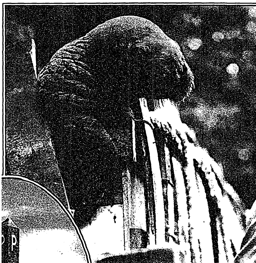
A CABIN PASSENGER FOR NEW YORK: A SEA LION Which Was Brought Back to the Bronx Zoo, Trying to Climb Out of the Crate Which Was Used as His Cage on the Trip.